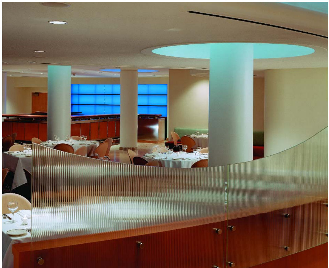
HENRY'S @ KLEINHANS Buffalo, New York